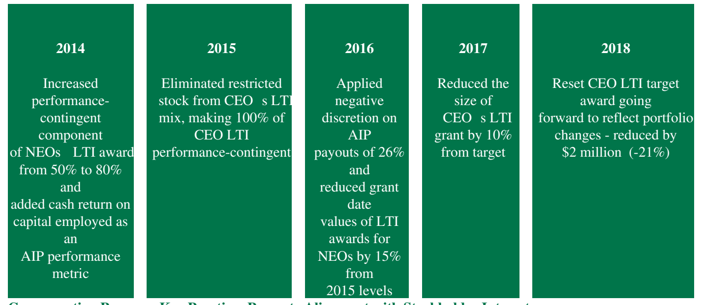
Compensation Program Key Practices Promote Alignment with Stockholder Interests

Over the last several years, the committee implemented a number of changes to our compensation program based on feedback we received and to align with the low oil price environment and our stockholders interests: